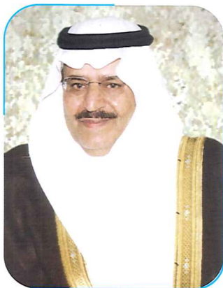
H.R.H. Prince Naif bin Abdul Aziz Al Saud Second Deputy Premier and Minister of Interior