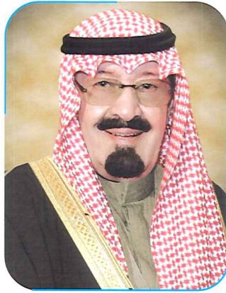
the Custodian of the Two Holy Mosques King Abdullah bin Abdul Aziz Al Saud