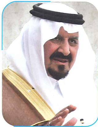
H.R.H. Prince Sultan bin Abdul Aziz Al Saud Crown Prince, Deputy Premier , Minister of Defense and Aviation and Inspector General