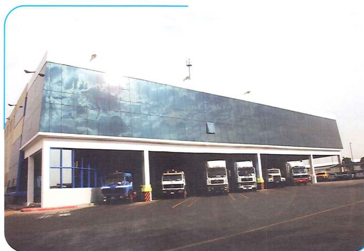
SADAFCO RDC , Jeddah